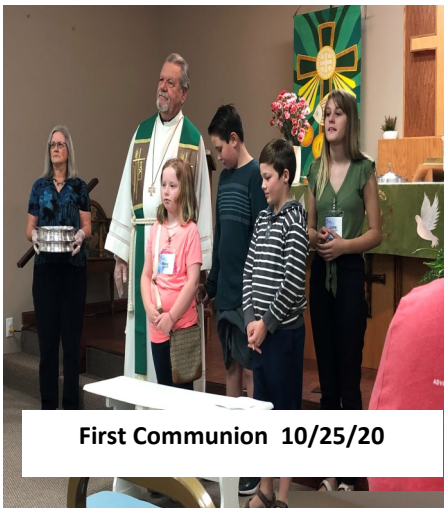
First Communion 10/25/20