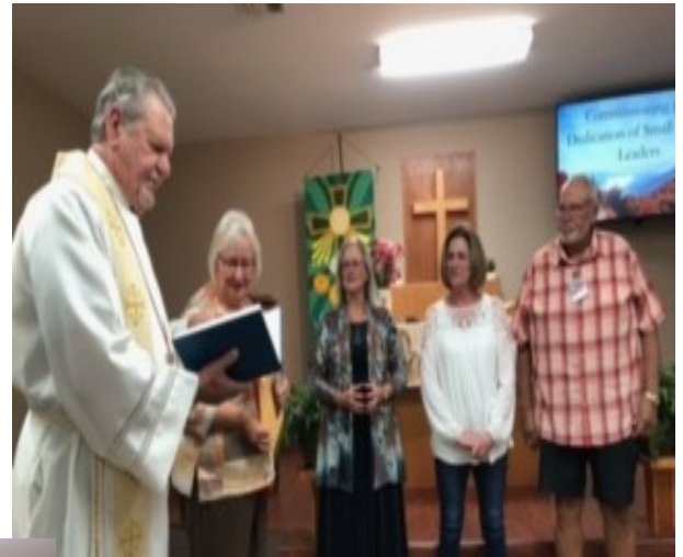
Commissioning of Small Group Leaders 11/1/20