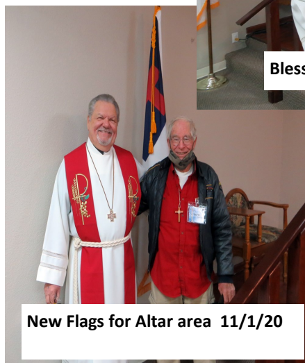
New Flags for Altar area 11/1/20