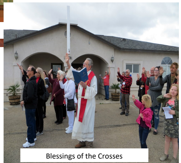
Blessings of the Crosses