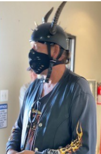
I was here last year and came back to see you this year!