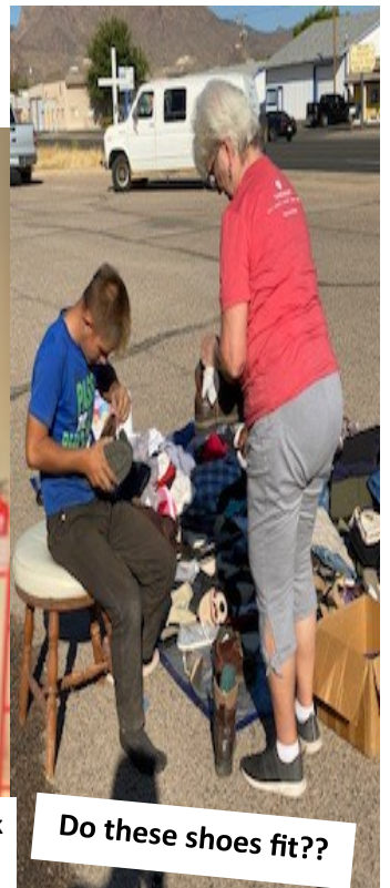
Do these shoes fit??