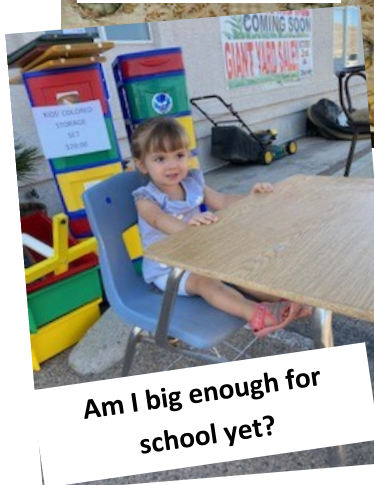
Am I big enough for school yet?