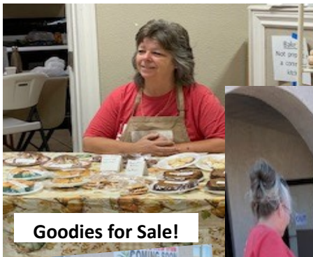
Goodies for Sale!