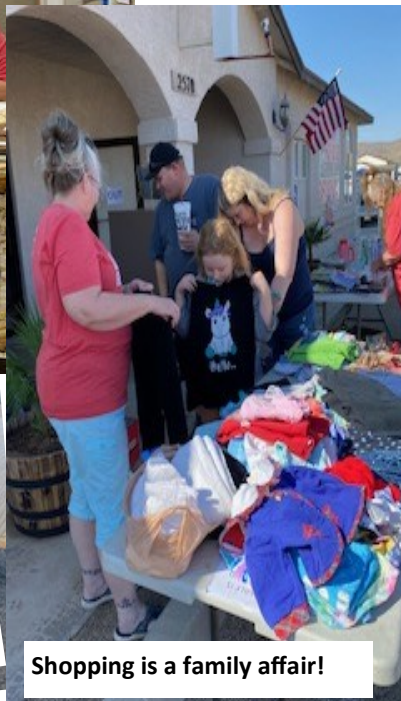
Shopping is a family affair!